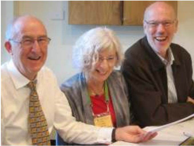
The AGM gets off to a good start