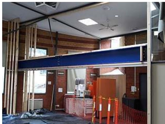
The movable wall under construction...