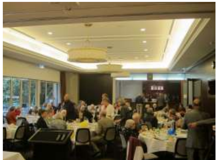
An enjoyable time was had by all.