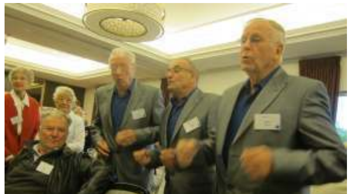
The Hillsmen serenade guests.