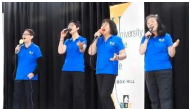
And see our Karaoke group on YouTube Linked from our website main page.